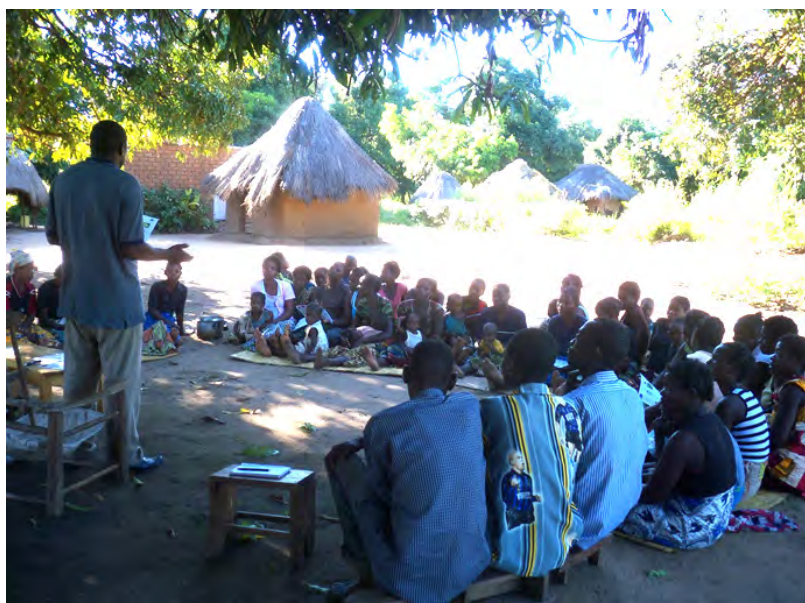
Producer group members gather for a field day led by lead farmers.

The decision to incorporate a population, health, and environment (PHE) approach to the COMACO model in 2010 was prompted by several factors including: growing family sizes that were posing a threat to natural resources and food security; the limited availability of information and methods about family planning in rural Zambia; and the long distances (often up to 12 kilometers) to health clinics. COMACO's Grants Administrator explained, "We realized it was not enough to just preach conservation farming and to provide households with alternative livelihoods skills and distribute [farm] inputs and buy their produce to market it to the shopping outlets. We realized that for the whole cycle to be complete, we needed to combine conservation with family planning. We realized it was important to integrate family planning into the livelihoods structure because only then would the family live a fulfilled life. If they knew how to plan their family size it would be easy for them to have enough labor on their farm plot. It would be easy for them to grow enough food to feed their household. And it would be easy for them to make their own income to take their children to school to provide for medical needs..." The integration of family planning activities was made possible with USAID funds