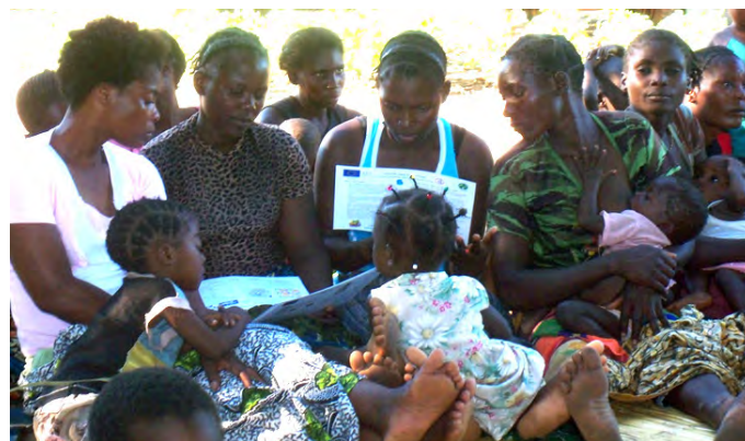
Producer group members using the Better Life Book to learn about the links between conservation, food security, and family planning.