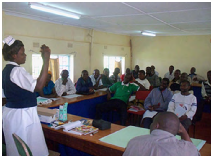
Training of COMACO peer educators in family planning.

In addition to field days, lead farmers sometimes meet with farmers from their producer groups as frequently as once per week because lead farmers