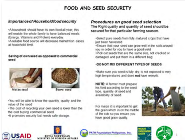
An example of family planning learning pages from COMACO's Better Life Book .