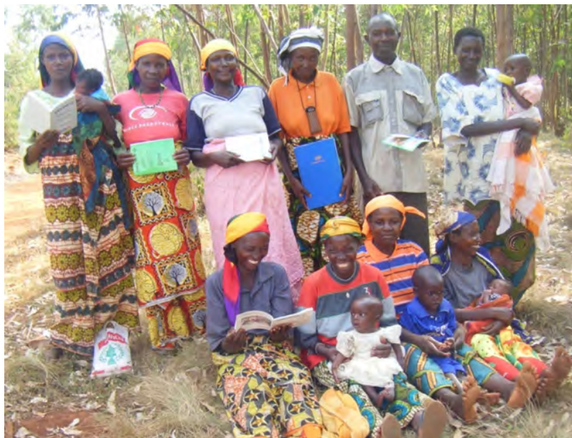
Ramba Kibondo Care Group

The program implemented two strategies to integrate family planning. At the community level, it used its existing community mobilization platform—the 209 care groups comprising close to 3,000 volunteers—as the entry point to deliver birth spacing interventions. The care groups were initially set up to deliver C-IMCI messages, including nutrition, and were involved in health education, data collection, and referrals to the health center. At the health center level, two providers per facility, primarily nurses trained in C-IMCI, including nutrition, were trained in family planning counseling and service delivery of modern and natural methods with funds from the Flexible Fund Grant. The figure