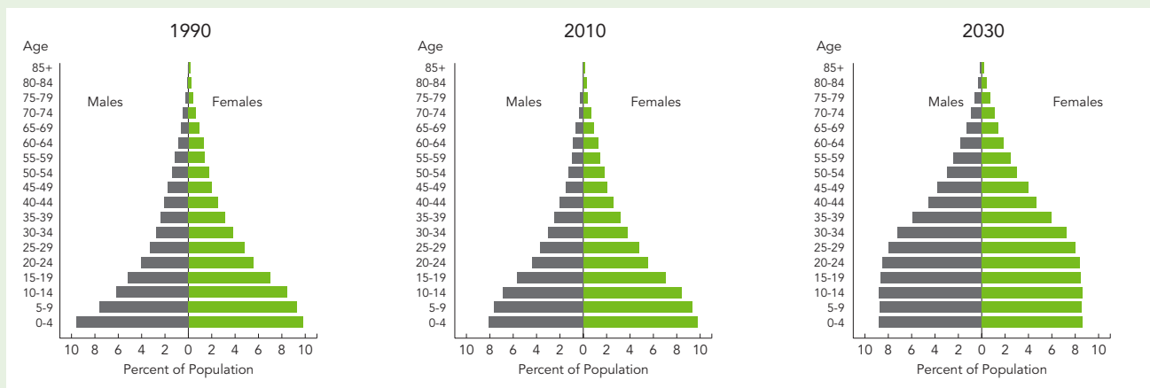
Source: UN Population Division, World Population Prospects: The 2012 Revision , (New York: United Nations, 2013).

lifetime to 4.8 children. “2030” is a projection of Ethiopia’s population age structure if fertility continues to decline and Ethiopia continues to make substantial investments in health and education. This pyramid assumes that by 2030, fertility will decline to an average of 2.6 children per woman over the course of her lifetime. “2030” shows a larger working-age population, compared to the number of dependent children and elders. Given the right investments in health, education, and job growth, this working-age population will have the opportunity to fuel economic development in Ethiopia.