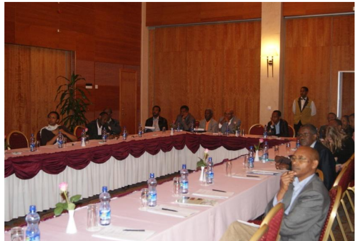
3/11/2011 National Validation Workshop on session